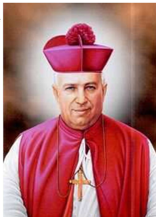
Saint Bishop Guizar Valencia

The official persecution of the Church in Mexico ended in 1929 but many laws restricting both human rights and the activities of the Church remain in effect and still damage society there.