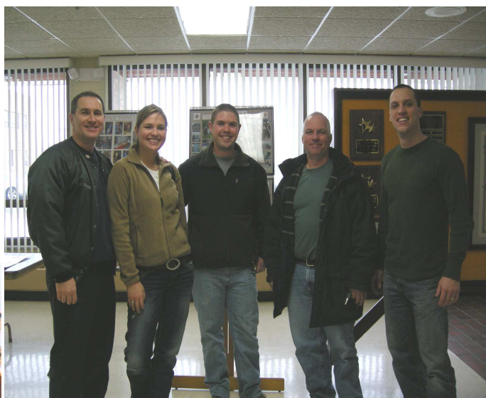
SOME OF MOKENA'S FIREFIGHTERS HONORED US BY SHARING OUR PANCAKE BREAKFAST